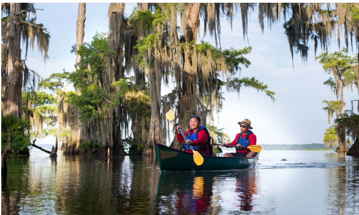
Morning paddle through the cypress trees of Lake Fausse Pointe on Day 5's paddle.