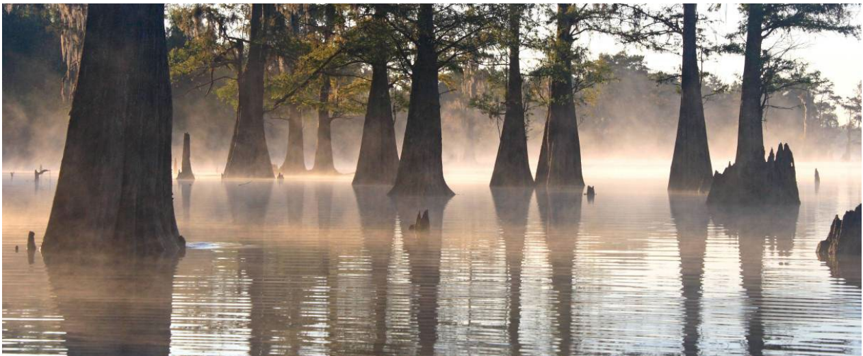
Misty Bayou Benoit morning.

Bless the waters that bring life to this land. Bless this journey to see the swamp firsthand. Bless the birds, the fish, and the trees. Bless this food that strengthens me. Bless the friendship and fellowship we feel, As we gather in the swamp for this meal. Amen.