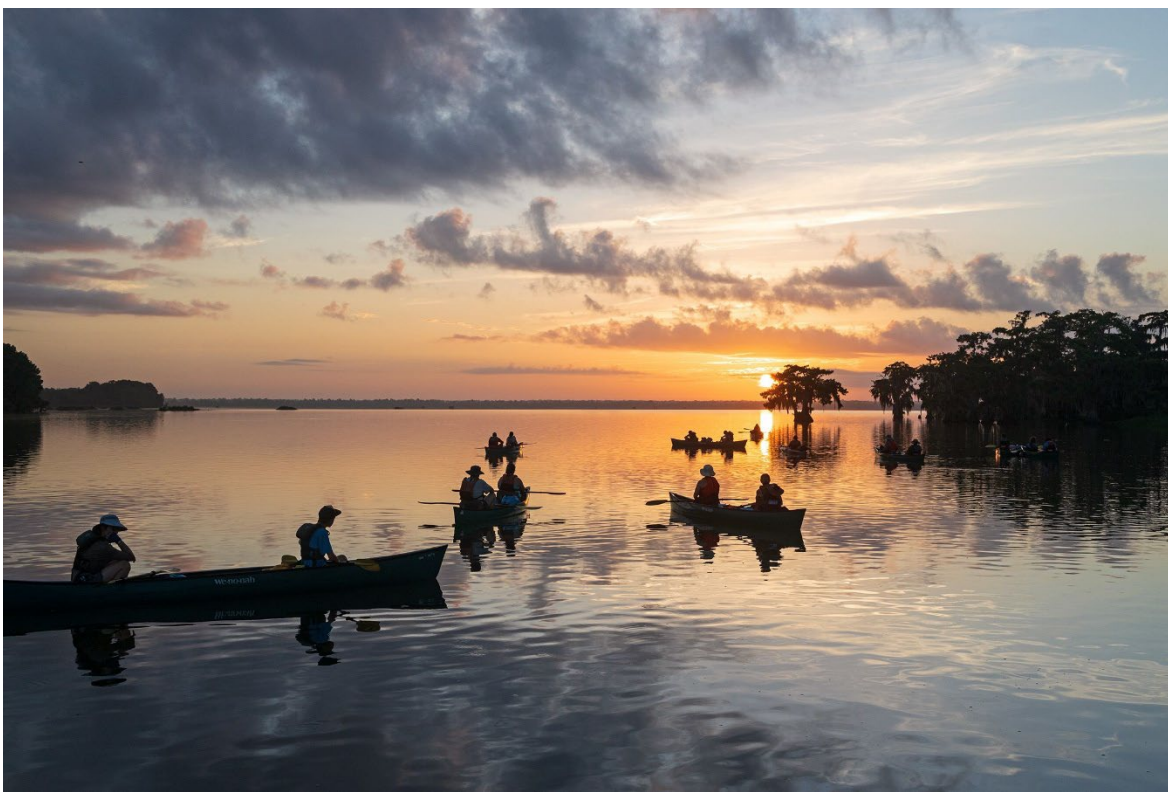
Scouts watch the sunrise over Sandy Cove in the early morning hours of Day 5.