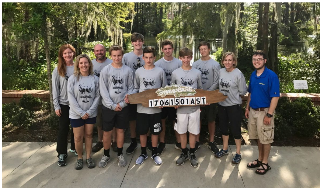
Trek crew 170615-01A-ST from the Sam Houston Area Council in Texas.

Upon arriving to Lafayette, LA, Swamp Base participants need to meet at the Wingate by Wyndham Hotel in Lafayette at 2:00 pm to begin their Swamp Base experience. The Wingate is located at 702 E Kaliste Saloom Rd. Scouts will be assigned a room for the night and have their trek guide complete their trek orientation, safety overview, and gear shakedown. Please see the ‘Trek Gear List’ for a complete list of required and recommended gear.