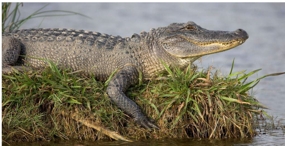
Alligators can be found throughout the trek. Always practice caution when in or on the water.