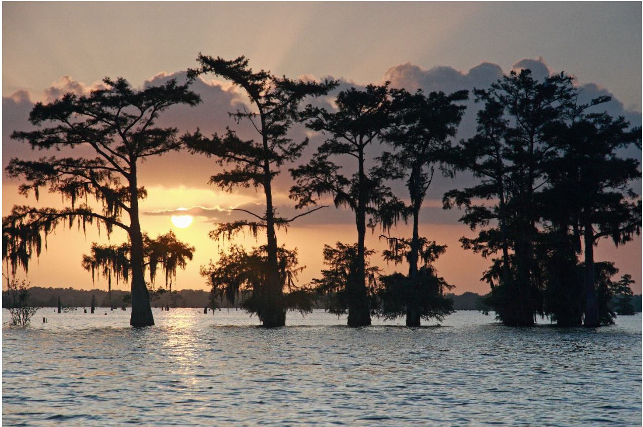
Sunset from the Floating Pavilions in the Henderson Lake area of the Atchafalaya Swamp.

From its majestic cypress and tupelo covered wetlands to the egrets and alligators inhabiting its skies and waterways, the Atchafalaya embodies swamp life in Louisiana. Pronounced “uh-CHA-fuh-LIE-uh,” the Atchafalaya gets its name from the Choctaw phrase for “Long River.” An unmatched American wonder, the Atchafalaya encompasses 1.4 million acres between Lafayette and Baton Rouge, LA. As the nation’s largest river swamp, the Atchafalaya serves as an important distributary of the Mississippi River Valley, relieving some 30% of the big river’s flood waters before they reach critical ports in Baton Rouge and New Orleans. The water that is directed down the Atchafalaya River through the swamp spillway flows through an ever-changing landscape of hardwood forests, farmlands, swamps, and marshes on its way to the Gulf of Mexico. As one of only six land developing river deltas, and the only such delta in North America with stable coastal wetlands, the Atchafalaya is a critical feature of the sustainability systems of Louisiana’s wetlands and the Gulf Coast.