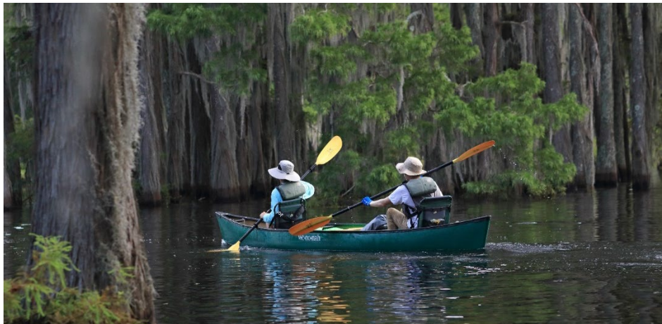
Trek Crew 190617-01A-ST paddling on their first day in the swamp.