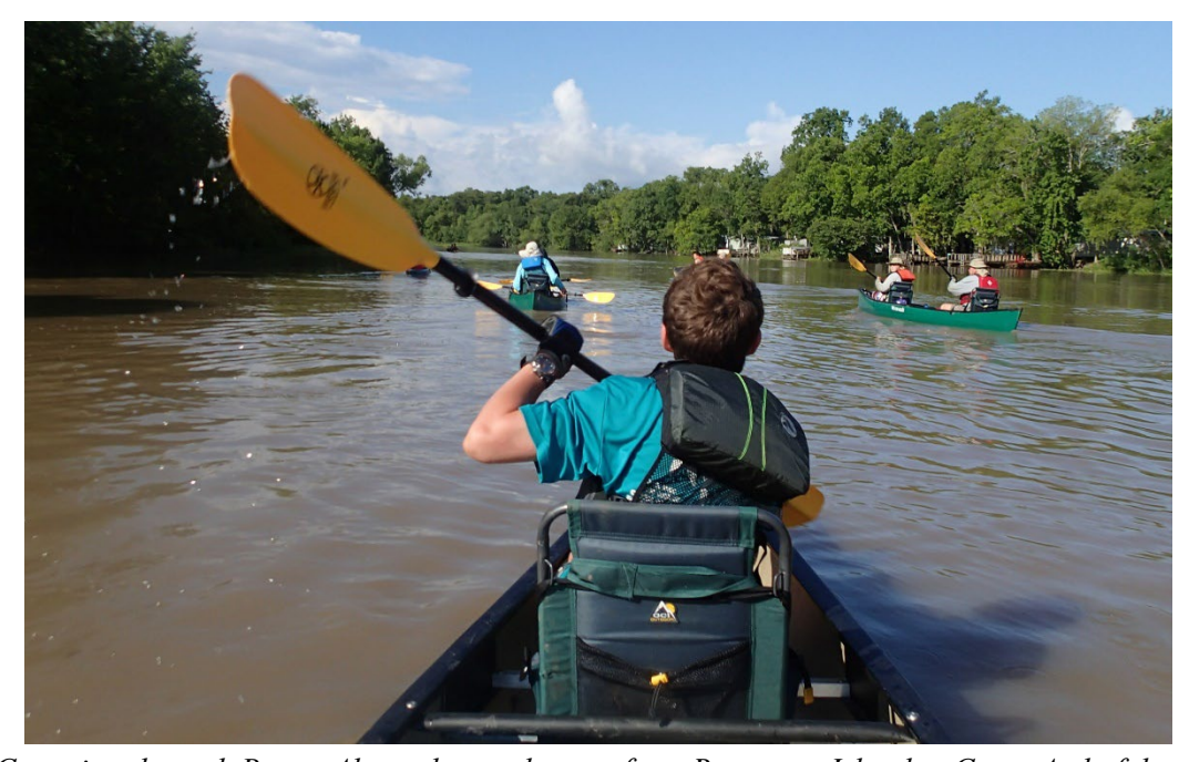
Canoeing through Bayou Alexander on the way from Rougarou Island to Camp Atchafalaya.