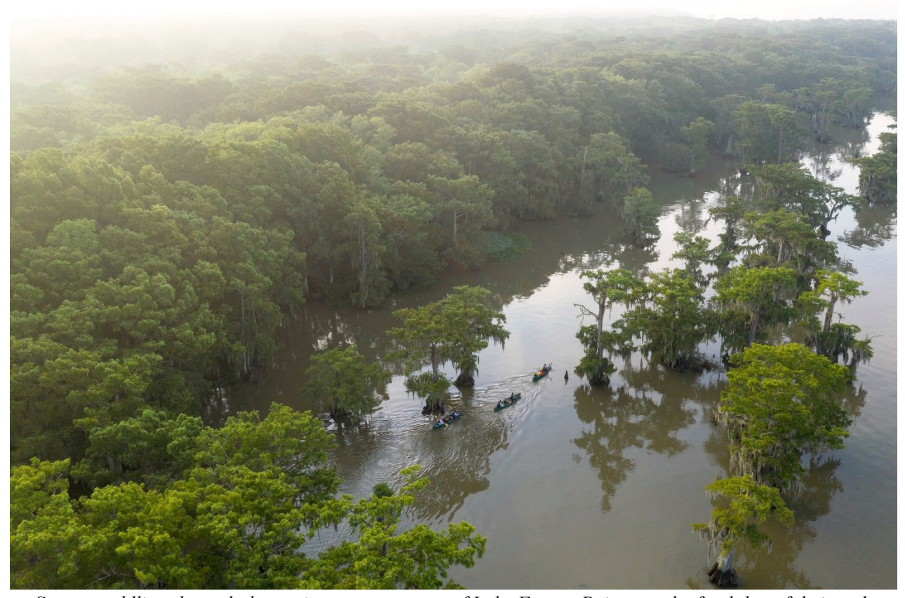
Scouts paddling through the ancient cypress trees of Lake Fausse Pointe on the final day of their trek.

For Scouts, the Atchafalaya presents the ideal adventure. Scouts will test their abilities and determination as each one of their senses soaks up the swamp's sights, sounds, textures, and flavors. Where the casual outdoorsman sees impassable bogs, frightful wildlife, and the daunting unknown, we Scouts see opportunities to learn, to appreciate, and to have fun!