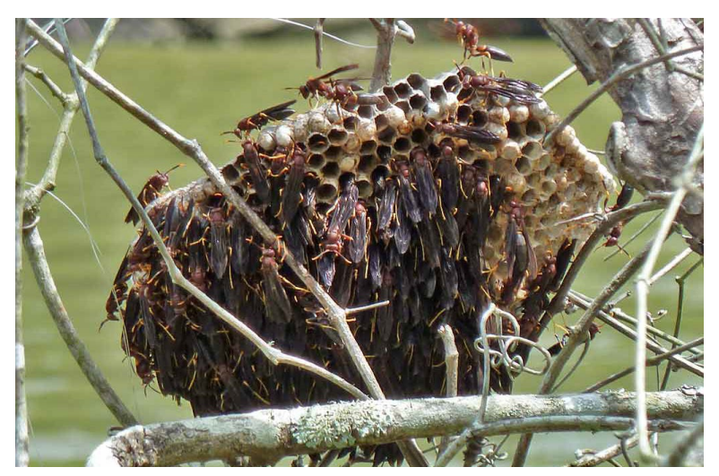
Undisturbed, nests in the swamp can become the home for hundreds of wasps.

If a crew member is sensitive or allergic to wasp/bee stings, be sure the individual carries their anaphylaxis kit (bee sting kit) with them. In some cases, wasp nests are built on low lying tree branches. Attention must be paid when paddling amongst trees, as to not disturb the nests. By no means should participants use their paddles to hit a nest. This type of activity can place the whole crew in trouble if people are stung or forced into the water. If crew members are sensitive to other insect or spider bites, make sure to have an antihistamine or a doctor recommended drug along. Insect repellent and proper clothing is recommended for protection against horse flies and mosquitoes.