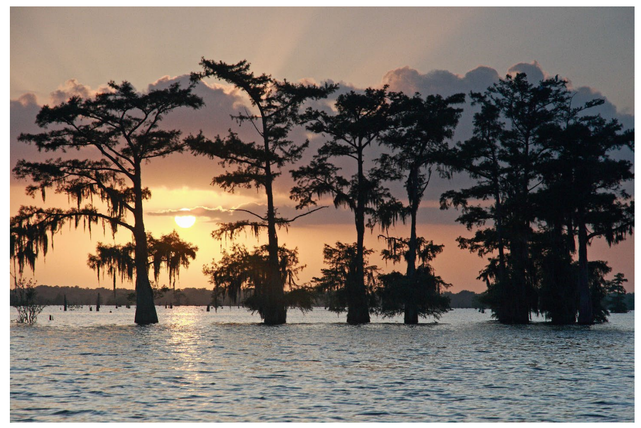
Sunset from the Floating Pavilions in the Henderson Lake area of the Atchafalaya Swamp.

From its majestic cypress and tupelo covered wetlands to the egrets and alligators inhabiting its skies and waterways, the Atchafalaya embodies swamp life in Louisiana. Pronounced "uh-CHA-fuh-LIE-uh," the Atchafalaya gets its name from the Choctaw phrase for "Long River." An unmatched American wonder, the Atchafalaya encompasses 1.4 million acres between Lafayette and Baton Rouge, LA. As the nation's largest river swamp, the Atchafalaya serves as an important distributary of the Mississippi River Valley, relieving some 30% of the big river's flood waters before they reach critical ports in Baton Rouge and New Orleans. The water that is directed down the Atchafalaya River through the swamp spillway flows through an ever-changing landscape of hardwood forests, farmlands, swamps, and marshes on its way to the Gulf of Mexico. As one of only six land developing river deltas, and the only such delta in North America with stable coastal wetlands, the Atchafalaya is a critical feature of the sustainability systems of Louisiana's wetlands and the Gulf Coast.