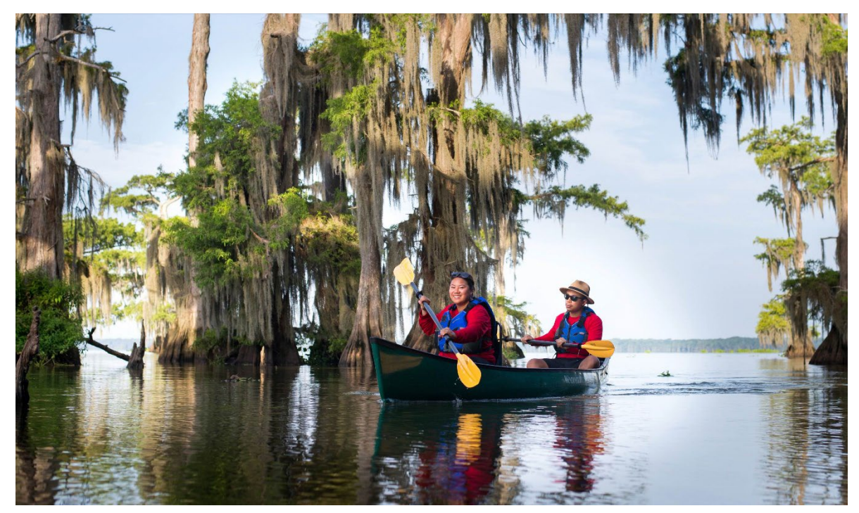
Morning paddle through the cypress trees of Lake Fausse Pointe on Day 5's paddle.