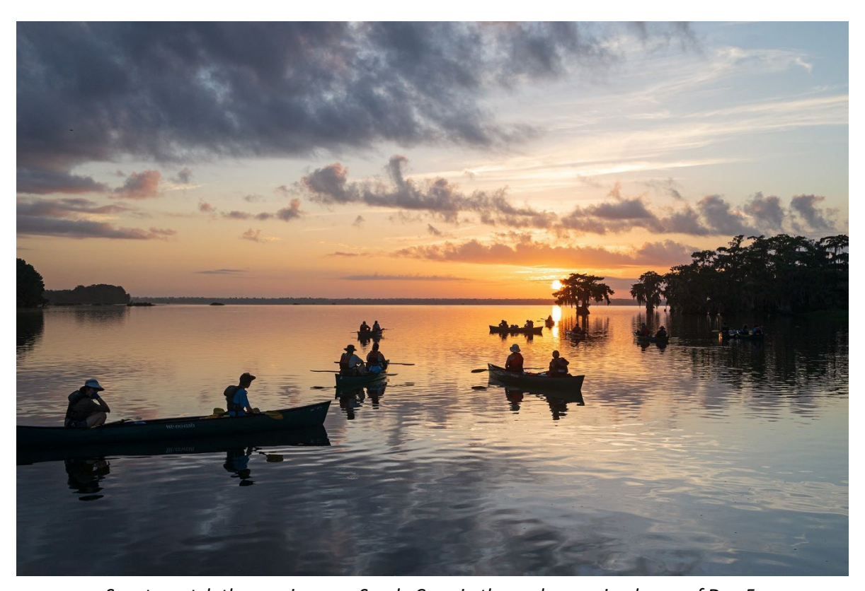
Scouts watch the sunrise over Sandy Cove in the early morning hours of Day 5.

IMPORTANT: Swamp Base requires two adult leaders on all treks. All trek crews participating in Swamp Base must have at least two adult leaders. For Troops, one of the adults must be over the age of 21; the other must be at least 18 years of age. For Venturing Crews, both leaders must be at least 21, and if the Crew is co-ed, you must have co-ed leadership. If you have more than one trek crew attending, each trek crew must have at least two adult leaders.