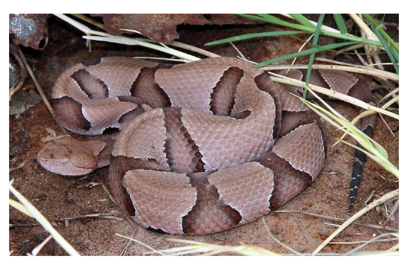
Copperheads prefer to live in wooded areas, near fallen trees, and around streams or ponds.