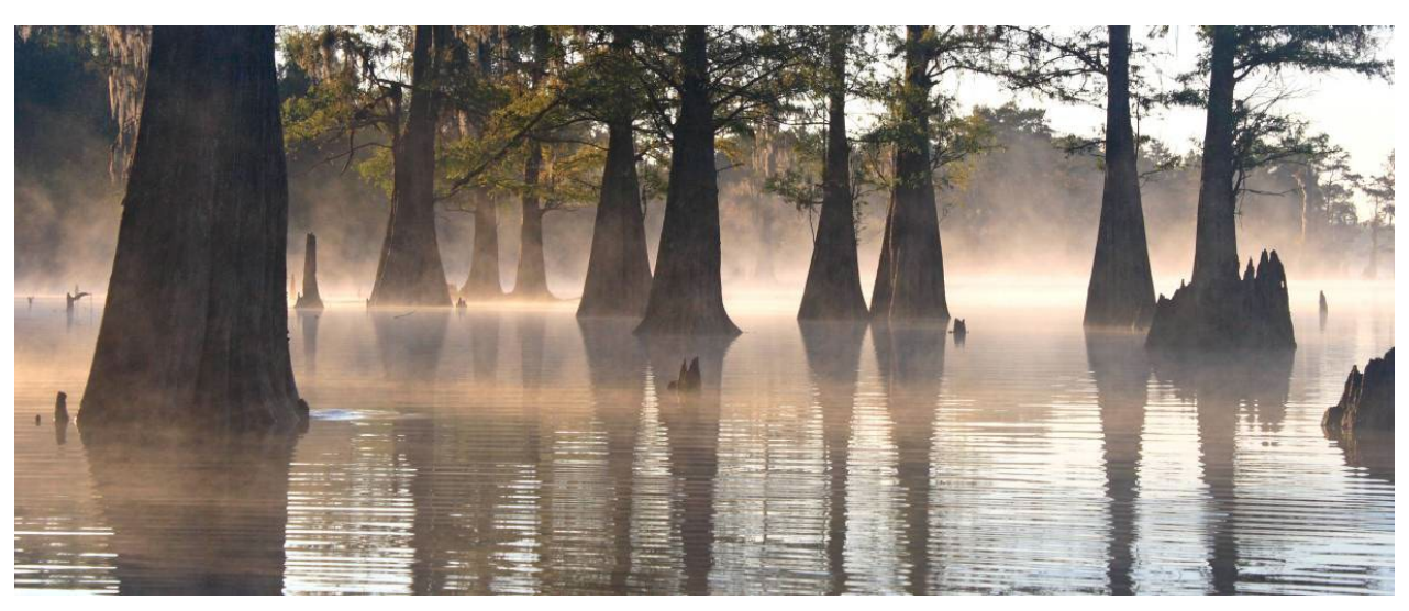
Misty Bayou Benoit morning.

Bless the waters that bring life to this land. Bless this journey to see the swamp firsthand. Bless the birds, the fish, and the trees. Bless this food that strengthens me. Bless the friendship and fellowship we feel, As we gather in the swamp for this meal. Amen.