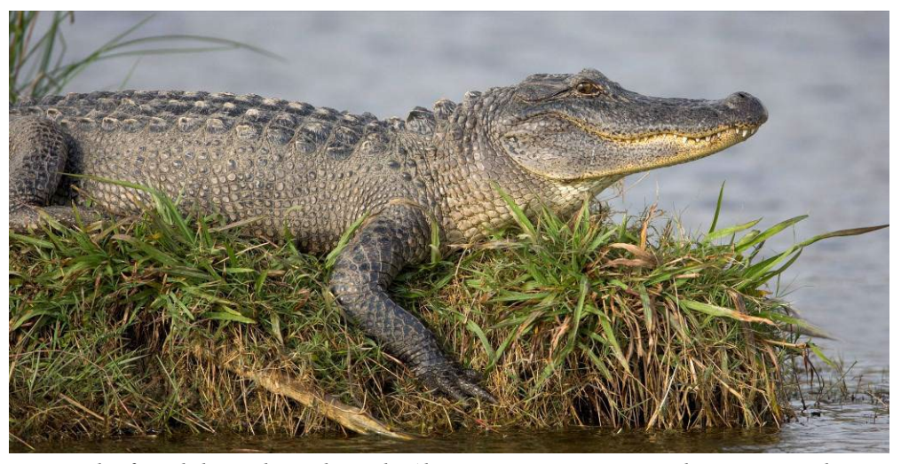
Alligators can be found throughout the trek. Always practice caution when in or on the water.