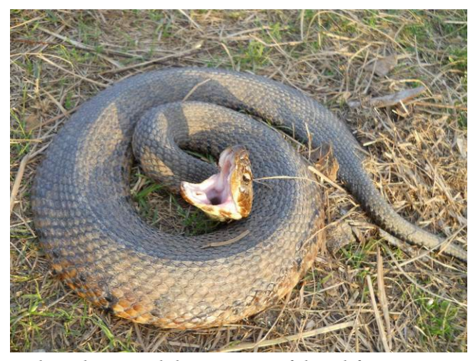
Cottonmouth snakes spend the majority of their life on or around water.